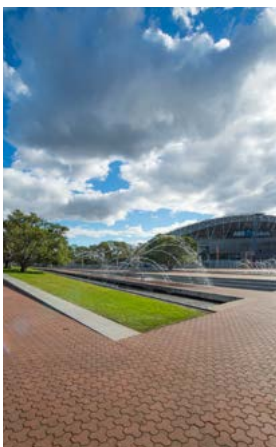
Fig Grove Fountain

World champion athlete Cathy Freeman has dedicated a paver to her family, inscribed with the message "To my family, love Cathy". Olympic legend Herb Elliot also endorsed the program, presenting Cathy Freeman with a special brick from the Australian Olympic Committee. These bricks are laid along with thousands of others engraved with personalised messages in the heart of Sydney Olympic Park. The ornamental pavers were manufactured at Boral's brick factory in Bringelly, New South Wales.